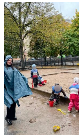
Video 3: As it was Harry Styles from 00:03:02