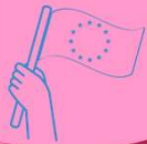
Commissioner Mariya Gabriel

The European strategy for universities and the proposal for a Council recommendation on transnational cooperation “ will benefit the entire higher education sector, first and foremost our students . They need modern transnational campuses with easy access to mobility abroad to allow for a truly European study path and experience. We stand ready to join forces with the Member States and higher education institutions across Europe. Together we can bring closer education, research and innovation in service to society. ”